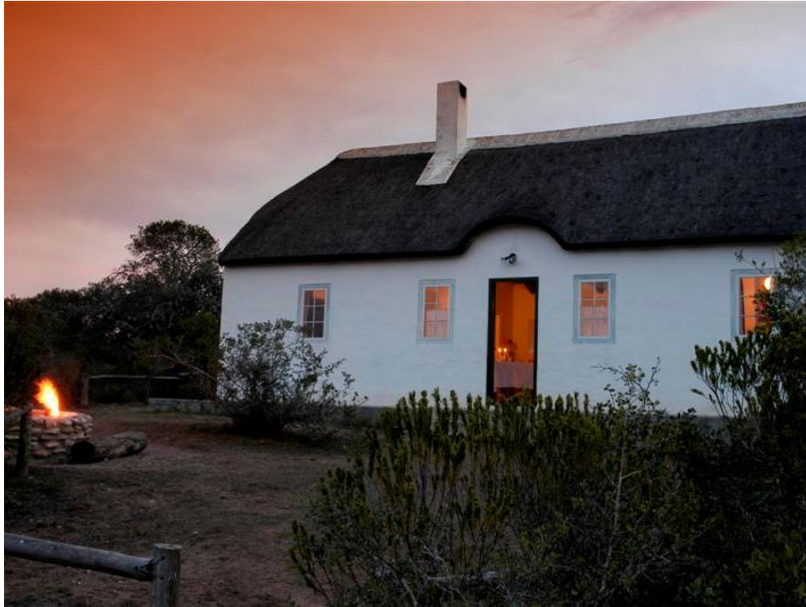
Opstal Vlei Cottages